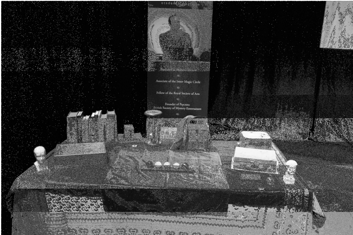
Figure 3. The Mystic's Table

For others (Larissa and Simon 36 ) the final table did not really interest them. My exchanges with both went as follows: